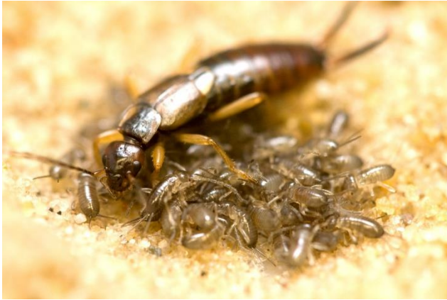
Figure 4 – A female of the European earwig providing care to her clutch of nymphs. This family life lasts about two weeks, during which time the mother provides multiple forms of care to the nymphs. Mothers may display competitive behaviour towards the nymphs. The nymphs show cooperative behaviour towards both their siblings and mother, but may display competitive behaviours towards their siblings, which can lead to siblicide.

The family then splits naturally, with the nymphs dispersing, forming new groups, and molting two more times before reaching adulthood (Figure 5; Dib et al. 2017; Tourneur et al. 2020). It remains unclear whether family splitting is driven by the mother, the nymphs, or both (Wong and Kölliker 2012), and we still don't know what the rules and dynamics of group formation by nymphs are. After splitting, some mothers may produce a second brood without re-mating (on very rare occasions, some will even produce a third or fourth clutch). The likelihood of producing multiple clutches depends on the population, and the physiological state and genetic background of the female (Lamb 1976a; Meunier et al. 2012; Wong and Kölliker 2014; Dib et al. 2017). The development of the second clutch follows the same steps as the first, and the nymphs become adults before the summer of the same year (Ratz et al. 2016; Dib et al. 2017). Regardless of whether she has produced one or two clutches of eggs, the mother eventually dies during summer. Males are generally thought to die earlier in the winter, although they can live as long as females under laboratory conditions (Tourneur and Meunier 2020).