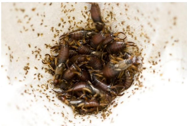
Figure 5 – A group of adults of the European earwig. Adults form mixed-sex groups of up to several hundred individuals. The genetic composition, the temporal stability, and the nature of the social interactions within these groups remain poorly understood.

The family then splits naturally, with the nymphs dispersing, forming new groups, and molting two more times before reaching adulthood (Figure 5; Dib et al. 2017; Tourneur et al. 2020). It remains unclear whether family splitting is driven by the mother, the nymphs, or both (Wong and Kölliker 2012), and we still don't know what the rules and dynamics of group formation by nymphs are. After splitting, some mothers may produce a second brood without re-mating (on very rare occasions, some will even produce a third or fourth clutch). The likelihood of producing multiple clutches depends on the population, and the physiological state and genetic background of the female (Lamb 1976a; Meunier et al. 2012; Wong and Kölliker 2014; Dib et al. 2017). The development of the second clutch follows the same steps as the first, and the nymphs become adults before the summer of the same year (Ratz et al. 2016; Dib et al. 2017). Regardless of whether she has produced one or two clutches of eggs, the mother eventually dies during summer. Males are generally thought to die earlier in the winter, although they can live as long as females under laboratory conditions (Tourneur and Meunier 2020).