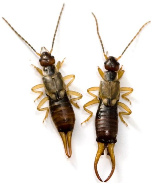
Figure 1 – Adults of the European earwig Forficula auricularia. Females (left) and males (right) have straight or curved forceps-like cerci at the end of their abdomen, respectively.