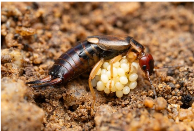
Figure 3 – A female of the European earwig providing care to her clutch of eggs. Females stay with their eggs throughout the winter, providing multiple forms of care while suspending their foraging activity from oviposition until the eggs hatch.

In early spring, the eggs hatch into juveniles, which are also called nymphs. Mothers stay with the nymphs for a few weeks (Figure 4), protecting them from predators, grooming and moving them around, and feeding them by regurgitation or by bringing them pieces of food (Lamb 1976b; Vancassel 1984; Staerke and Kölliker 2008; Meunier et al. 2012). Unlike egg care, nymph care is not required for the development and survival of the nymphs – at least under laboratory conditions (Lamb 1976b; Kölliker 2007; Meunier and Kölliker 2012a, b). Although post-hatching family life appears to be facultative (nymphs can be reared without mother and siblings), mothers remain with their nymphs for two to three weeks, until they reach the second or third instar. During this time, mothers may adopt foreign nymphs, which sometimes seek adoption under natural conditions (Kölliker and Vancassel 2007).